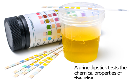
A urine dipstick tests the chemical properties of the urine.

High blood pressure (hypertension) is associated with diabetes both in humans and in dogs. Hypertension may develop over time when your pet has diabetes, so regular checks of blood pressure are important. Left untreated, hypertension can lead to blindness, kidney failure, and stroke.